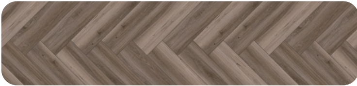
AU Spotted Gum